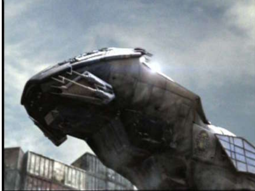
“Hey Kaylie, think we can pull a Crazy Ivan?” –Wash

While technically part of the equipment section, spacecrafts represent more than just equipment they represent freedom. Freedom from the Alliance, freedom from corporations the freedom to be yourself to many this is their only way to gain such freedom. The GM may start a party off with a ship (a small freighter such as a firefly or Phoenix class) or may have the party start playing the crew of an NPC captain’s ship either way, Players will have to deal with Starcrafts one way or another. The following is a list of ships and their price. Prices for ships (unlike equipment) is rated in credits meaning to figure it’s platinum cost would cost 2.5 times that amount in platinum.